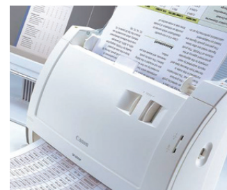
Reliable and Fast Document Capture

Bundled with CapturePerfect®, Adobe® Acrobat® Standard, ScanSoft PaperPort, Presto! BizCard SE, and OmniPage® SE, the DR-2050SP and DR-2050C devices become more than just scanners. They offer scanning options such as save, print, and e-mail-scanned images with one-click simplicity plus built-in OCR capabilities to make it easier to create searchable PDF files. Bundled with this latest document imaging software package, the DR-2050SP and DR-2050C scanners are small investments worth making.